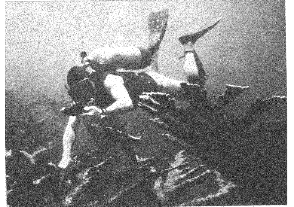
Scuba diver examines a piece of the coral on a Caribbean reef.